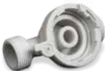
Hose fitting printed in DuraForm ProX GF