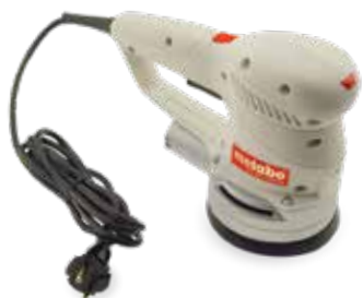
Sander tool housing printed in DuraForm PA material

3D Systems sPro SLS systems share a common architecture to produce high-resolution, durable thermoplastic parts available in medium to large build volumes.