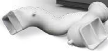
Manifold printed in DuraForm ProX FR1200