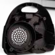
Back cover of vacuum cleaner printed in DuraForm EX Black